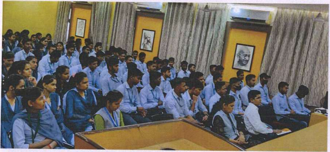
Guiding session on environmental science projects.